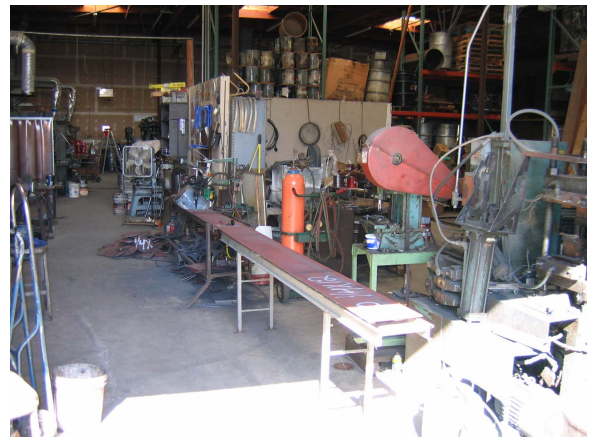
Welding, cutting, machining